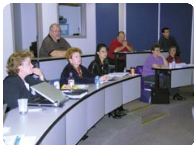
careQuest Transformation Team members at Design Session 1.